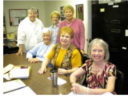
Running and Winning Steering Committee