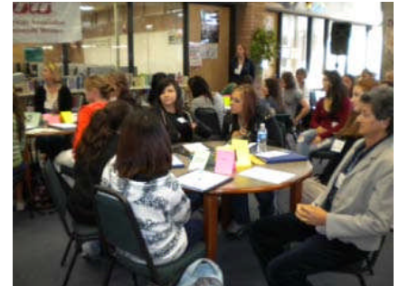
A successful Running and Winning Workshop